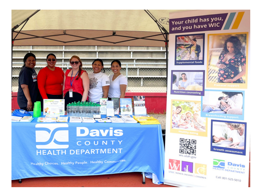
Safe Kids Day June 1, 2024