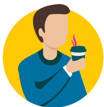
Decrease in sense of smell or taste