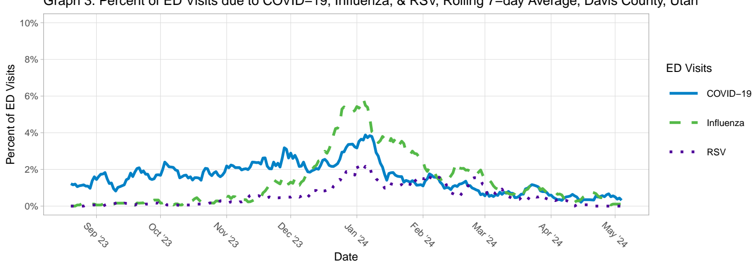
Graph 3. Percent of ED Visits due to COVID-19, Influenza, & RSV, Rolling 7-day Average, Davis County, Utah

Graph 3 displays the rolling 7 day average of the percent of emergency department (ED) visits due to COVID-19, influenza, and respiratory syncytial virus (RSV). These data are obtained from syndromic surveillance and only consider the diagnosis discharge codes for each condition. Table 1 presents two data points for each virus: the current trend of ED visits (increasing, decreasing, or no change), and the percent of ED visits due to each during the currently reported week.